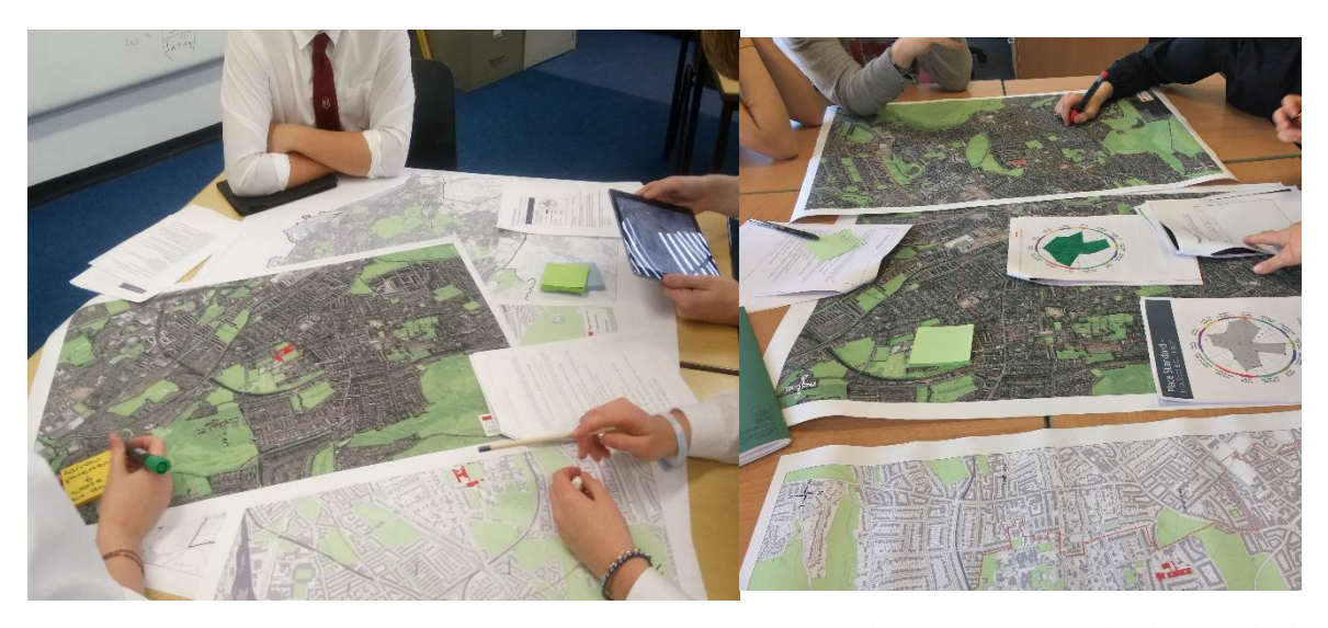
Young people engagement using the place standard