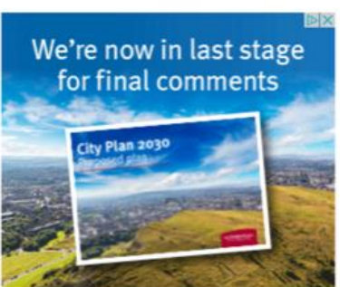
Online advert sequence