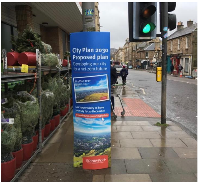
City Plan 2030 lamppost wrap

CITY OF EDINBURGH COUNCIL PLANNING ETC. (SCOTLAND) ACT 2005 ENVIRONMENTAL ASSESSMENT (SCOTLAND) ACT 2006 CITY PLAN 2030 PROPOSED PLAN – NOTICE OF PUBLICATION & REPRESENTATION PERIOD