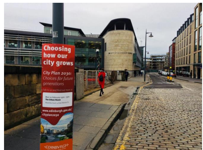
Early engagement display